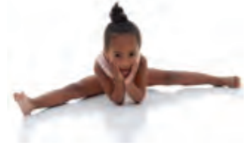
Printed August 2009

MONDAY: 10:30am-11:15, 5:00pm-5:45pm TUESDAY: 9:30am-10:15am, 6:00pm-6:45pm WEDNESDAY: 9:30am-10:15am, 4:15pm-5:00pm THURSDAY: 10:30am-11:15am, 5:00pm-5:45pm SATURDAY: 9:00am-9:45am,10:30am-11:15am, 11:15am-12:00pm